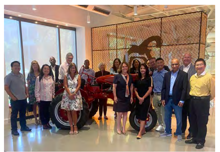
NACD Member Experience, Chipotle Development Center

Directors gather for virtual or in-person interactive conversation to discuss hot-off-the-press board issues to ensure that they stay relevant and up to date. In the Pacific Southwest, our programs often anticipate emerging boardroom trends.