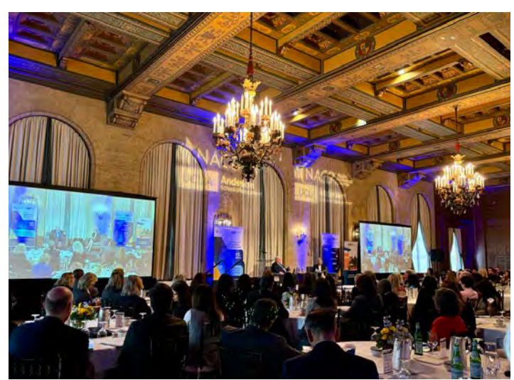
Corporate Director Symposium, Jonathan Club

Cutting-edge board topics are the feature of the evening, but friendships are the result. A fun cocktail hour followed by an intimate and engaging dinner conversation keep our curated group of directors asking for more.